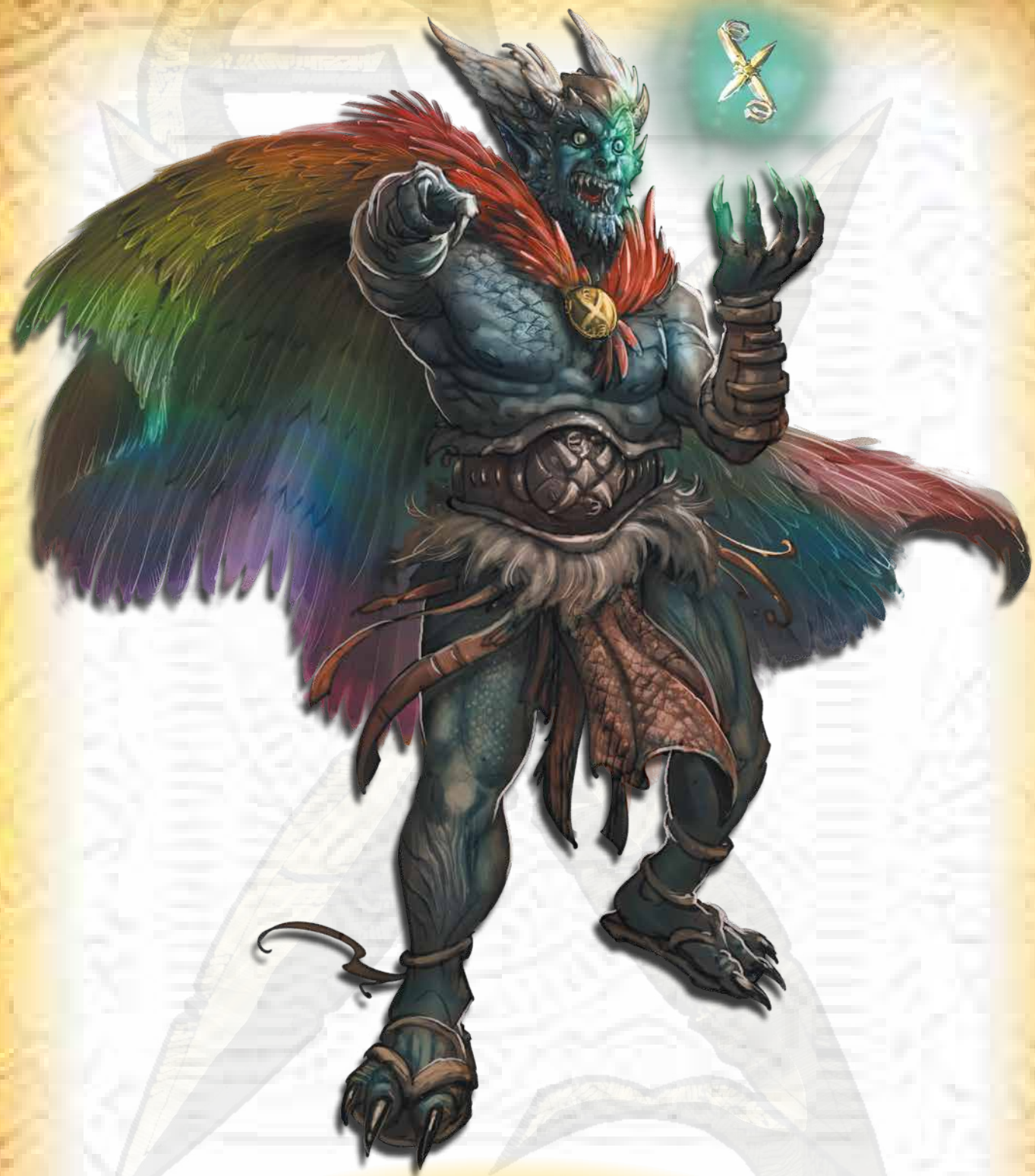
Ex The Master Extractor